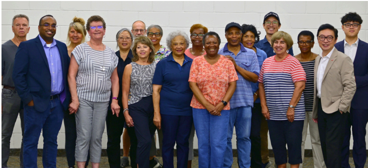
Group Photo from OTF Recognition Ceremony for Freezer and Fridge