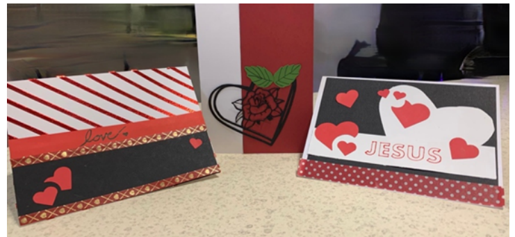
Handmade greeting cards made for those unable to go out.